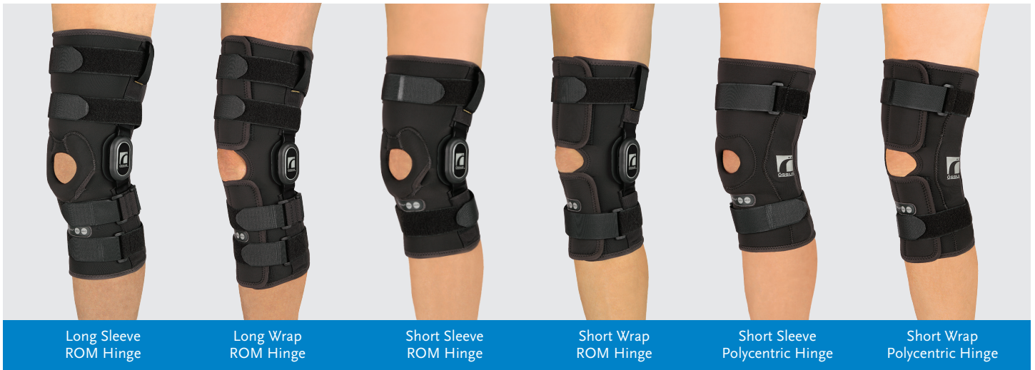
Long Sleeve ROM Hinge

With six variations to choose from, Össur's Rebound Hinged Knee Brace product line is a comprehensive portfolio of high-quality braces designed to serve the needs of a broad range of patients.